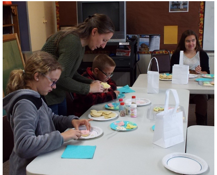
Sunday School Class Decorating Easter Cookies for Coffee Hour